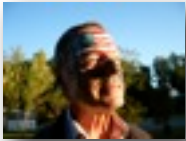
Our ink-stained wretch

Avid readers (aren't you all?) of this periodical will remember the clarion call last summer to name it and to suggest an appropriate motto. For those not remembering, the Clarion Call is reproduced here: