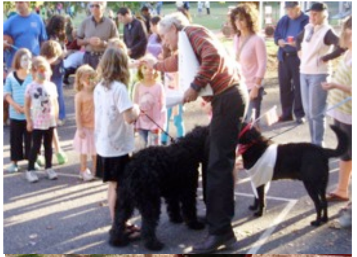
Dog Show Award Presented