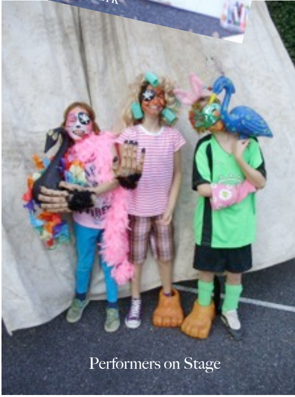
Performers on Stage