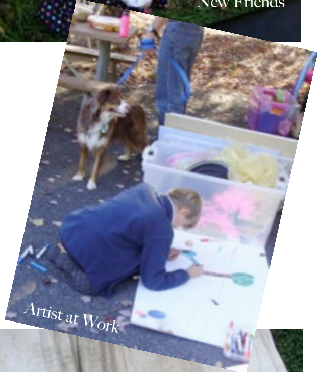
Artist at Work