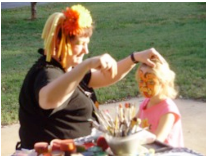
Face Paining Artist and Customer