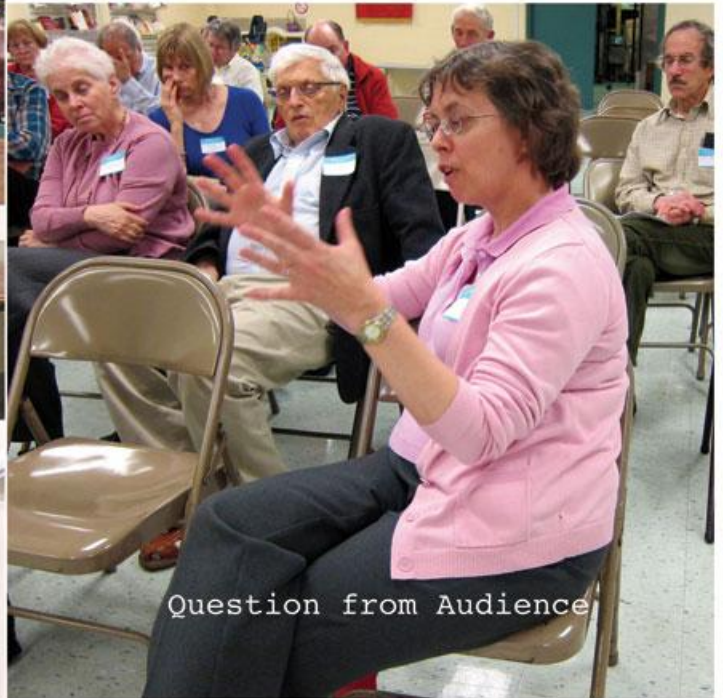
Question from Audience