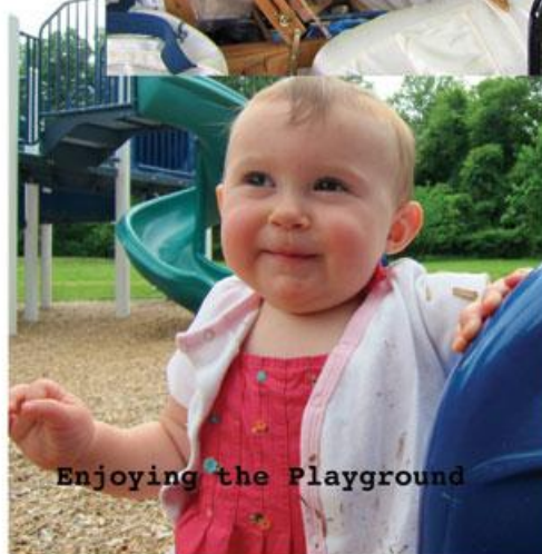
Enjoying the Playground