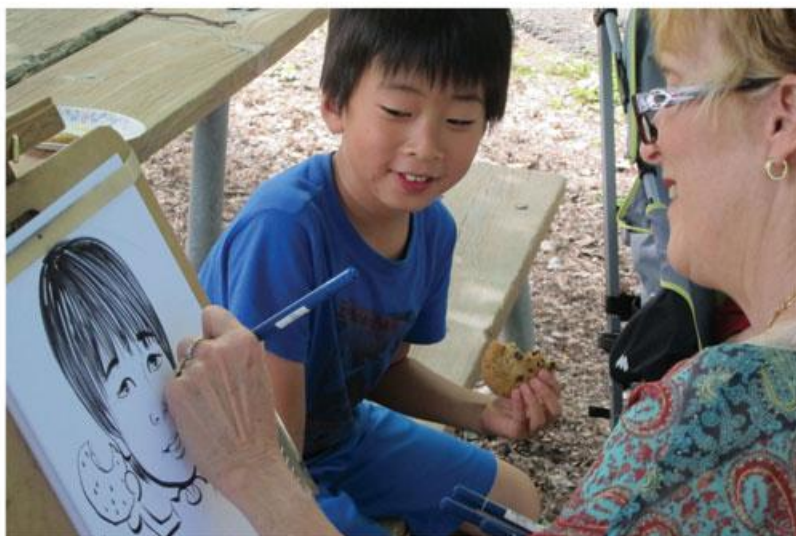
Artist and Customers