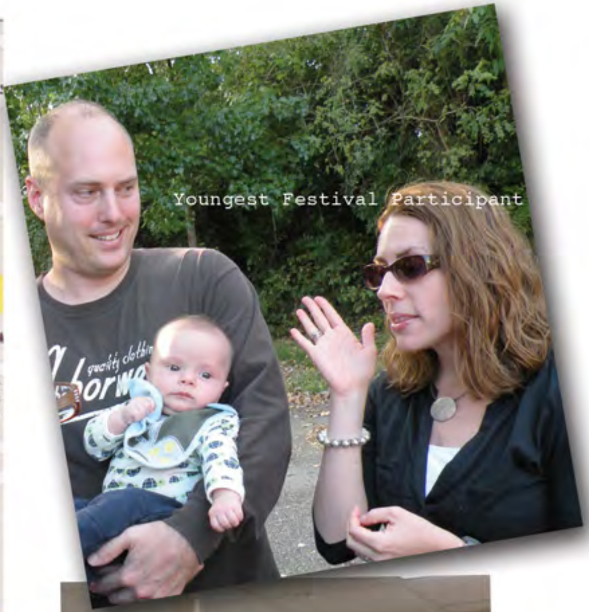
Youngest Festival Participant